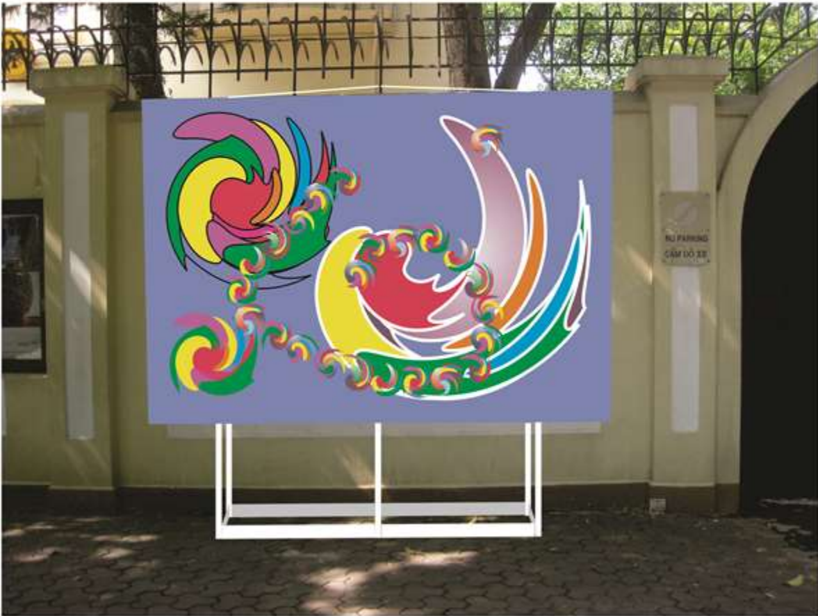
PHỐI CẢNH KHUNG TRANH TREO TRÊN KHUNG NHÔM LẬP GIÁP