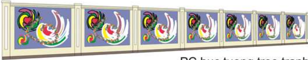
PC buc tuong treo tranh