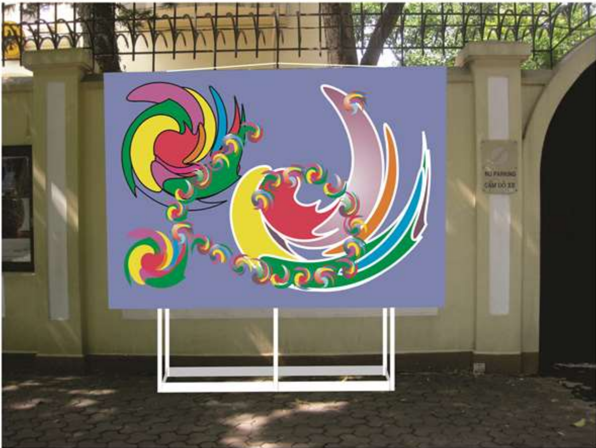
PHỐI CẢNH KHUNG TRANH TREO TRÊN KHUNG NHÔM LẬP GIÁP